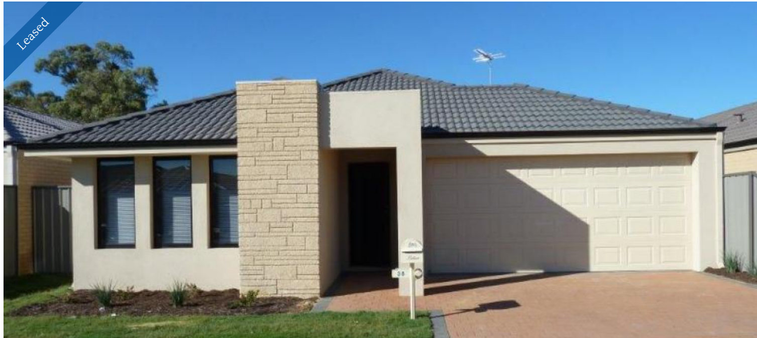
38 Grafton Rise, Baldivis