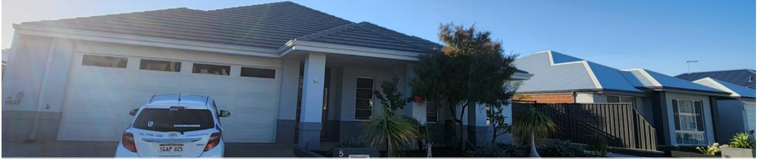
5 Putter St, Yanchep