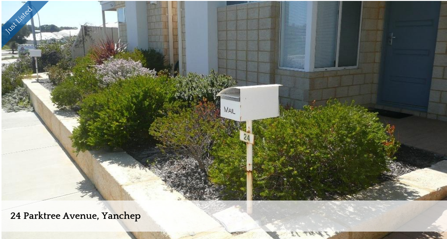
24 Parktree Avenue, Yanchep