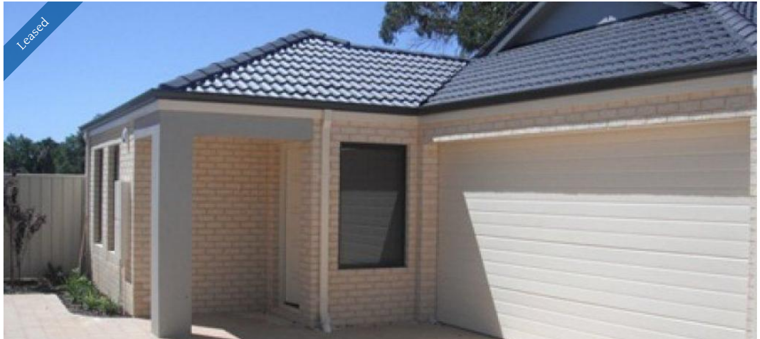
Unit 4, 9 Friar Road, Armadale