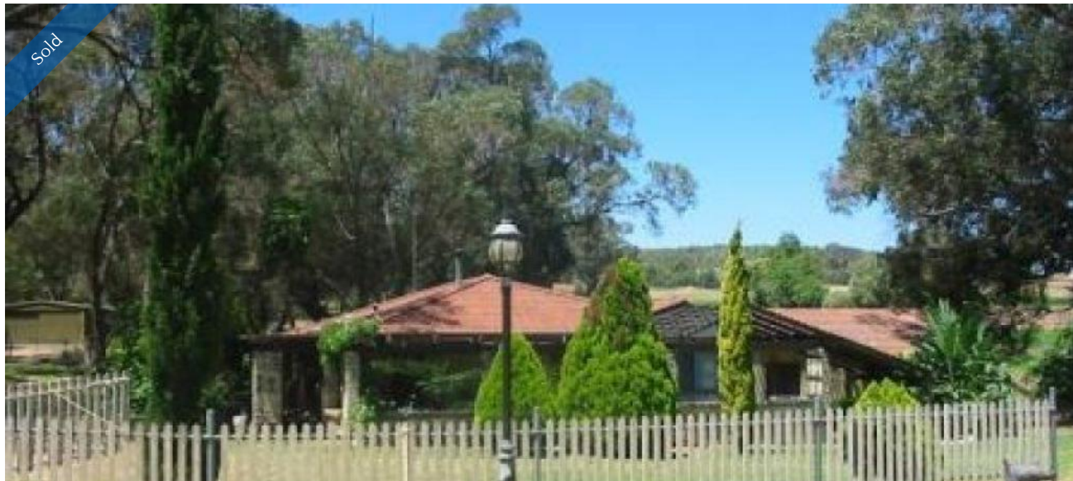
Lot 124 Gibbs Road, NOWERGUP Street, Wanneroo