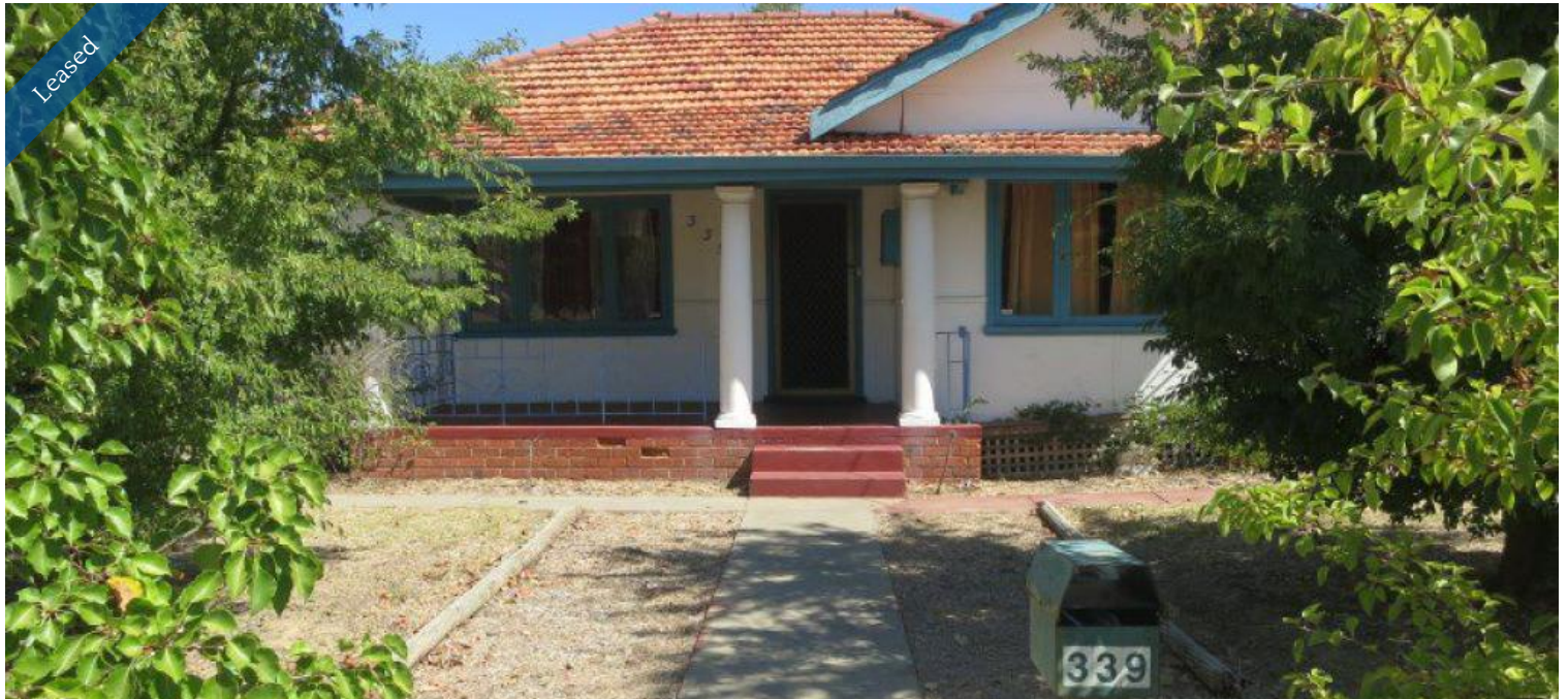
339 South Street, Hilton